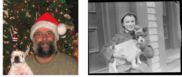
a man wearing a santa hat holding a dog posing for a picture

In this paper, we present a novel query expansion approach for image captioning, in which we utilize a distributional model of meaning for sentences. Extensive experimental results on three well-established benchmark datasets have demonstrated that our approach outperforms the state-of-the-art data-driven approaches. Our future plans focus on incorporating other cues in images, and