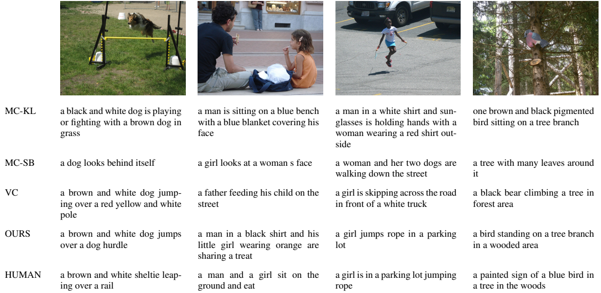
Figure 2: Some example input images and the generated descriptions.